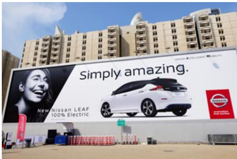
Nissan is one of the better-placed VMs in the world of electric vehicles, making the world's best-seller – the Leaf

adapt to a new information environment demands much higher levels of visibility, "not just in Tier 1 and Tier 2 suppliers but further down the supply chain". The problem is that many of the solutions required to do this are not really in place – he observes that "blockchain is not ready to be industrialised today", for example. If so, the logistics information infrastructures that so many in the automotive sector have spent so much on will have to be adapted very quickly – for the business of building electric cars, the destination will be a quick, agile supply chain with extended geographical structure and new types of sub-assembly facilities.